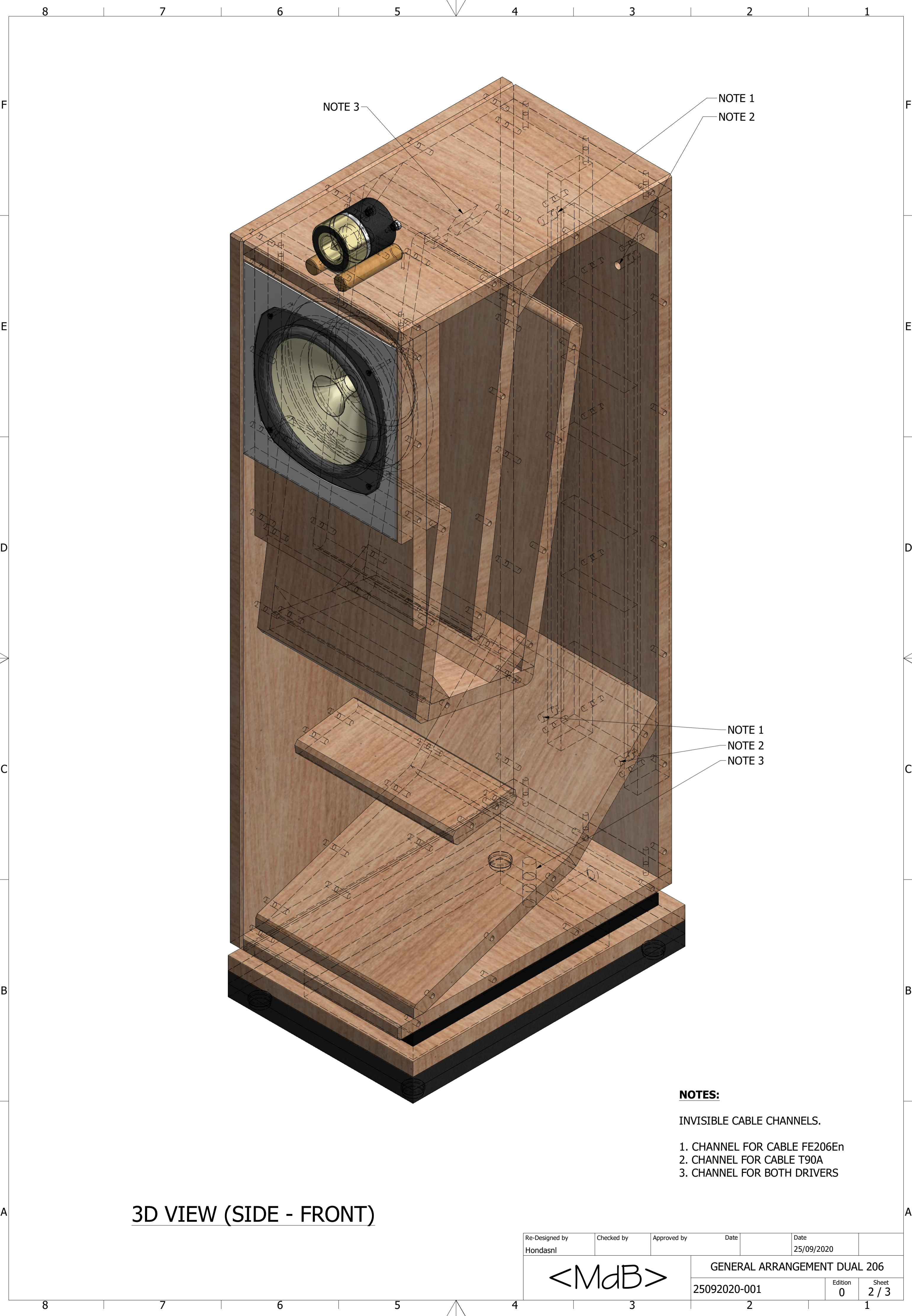
3D VIEW (SIDE - FRONT)